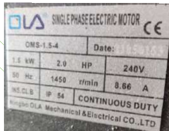
SINGLE PHASE MOTOR