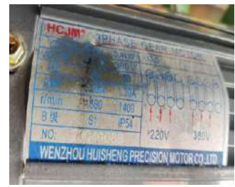
3 PHASE MOTOR